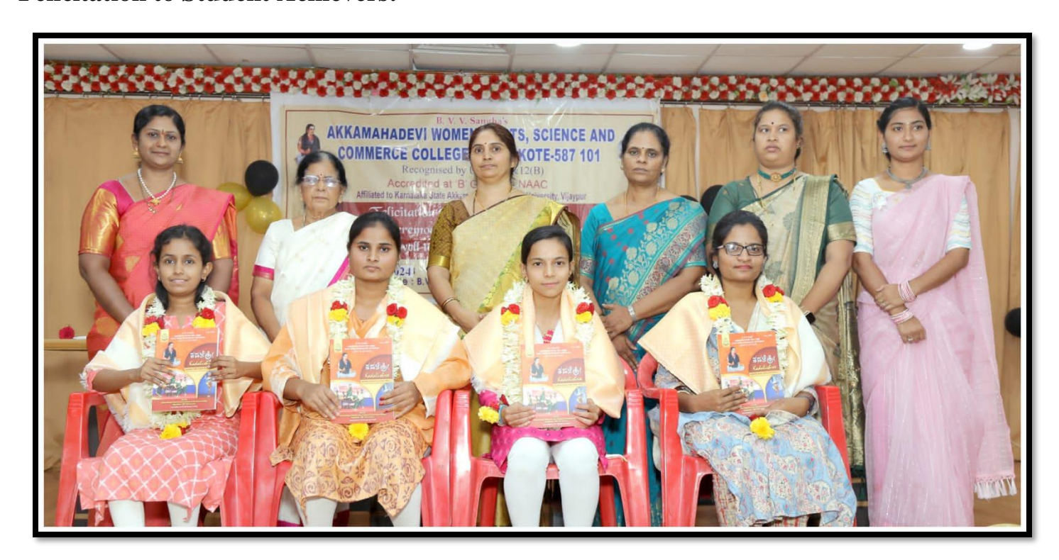
Highest Scorers in University Exams