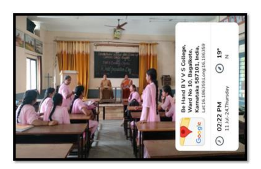
Group Discussion by Department of Sociology