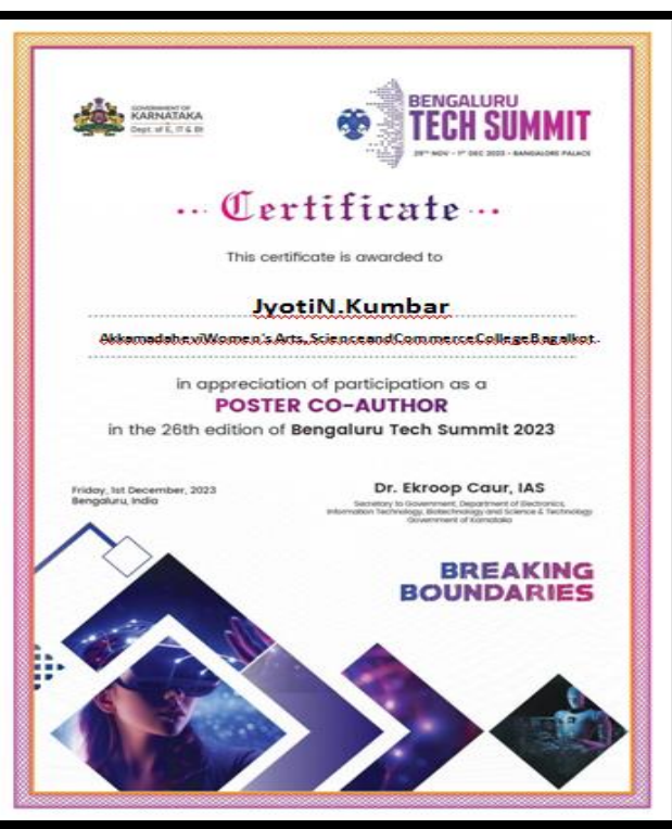
M.Sc final year students participated as a Poster Co-Author in the 26<sup>th</sup> Edition of Bengaluru Tech Summit 2023