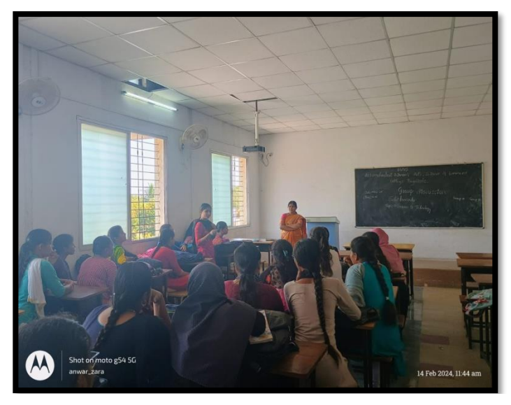
Group Discussion by Department of Kannada